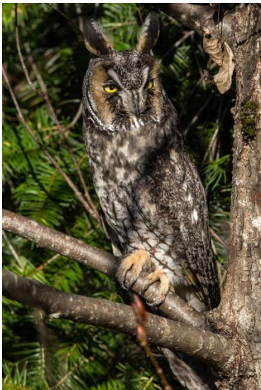
Long-eared Owl , Area 3, anonymous