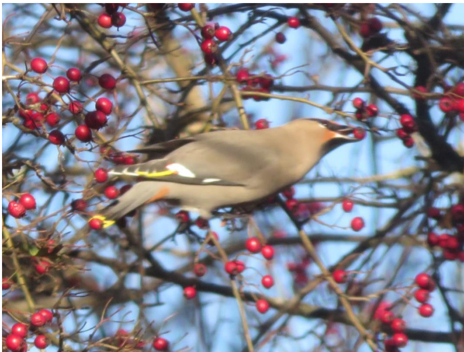
Bohemian Waxwing , along Jamestown Rd. in Sequim, Clallam County, WA, early December 2016.