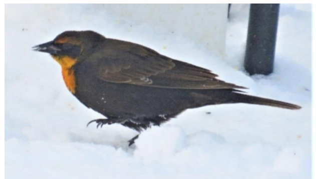
One of three Yellow-headed Blackbirds , Island Crossing (Area 3), December 29, 2021.

Missed. As happens each year, a few of the regulars were missed on the CBC. Red Crossbill and Evening Grosbeak were missed, although some of the latter were east of Highway 9 during the period, at our place (we live just outside the CBC area, however). Semipalmated Plover and Long-billed Dowitcher , two shorebirds we've gotten used to finding at mudflats over the last ten years, were both missed. David Poortinga's three Yellow-headed Blackbirds (!) just missed count day, at Island Crossing. This blackbird is rare-but-annual in migration in western WA, rarer in summer, very rare in winter. I don't believe there is an analogous winter record of