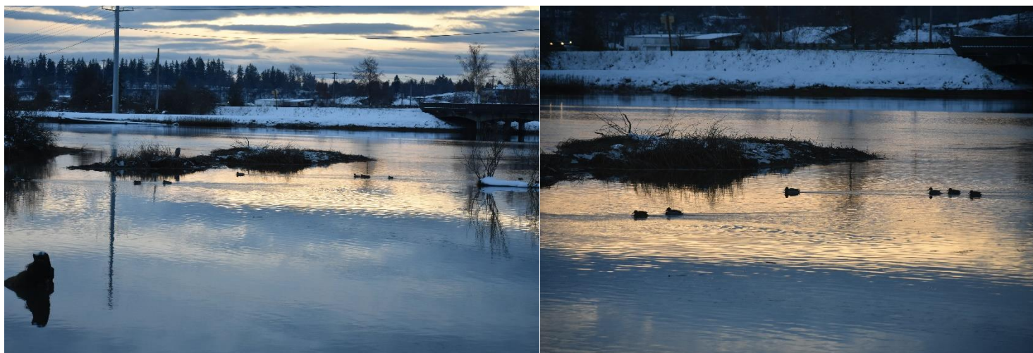
The Everett-Marysville CBC comes to a close (two views at dusk, January 1, 2022, looking south toward north Everett, from the Union Slough Restoration Area near I-5)