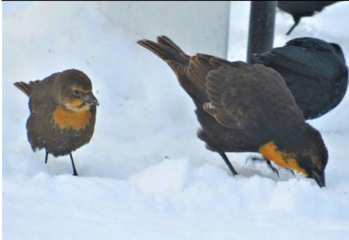
Two of three Yellow-headed Blackbirds, Island Crossing, December 29, 2021.