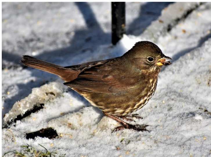
Just one of many (Sooty) Fox Sparrows that became more visible—at feeders—during the deep freeze.