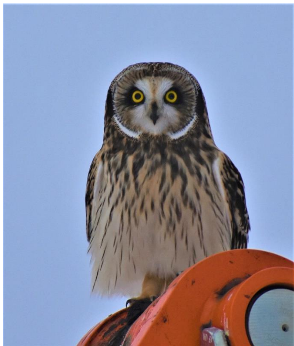
One of three Short-eared Owls flying around the former Biringier Farm property in the afternoon of the CBC, this one happy to perch on some human hydraulics (medium pressure) powering a small excavator’s boom