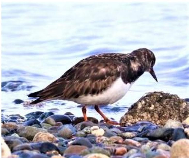
Ruddy Turnstone, Tulalip Bay, January 1, 2022.

Area 6 ( central Tulalip including Tulalip Bay and Hermosa Pt. ) saw the return of veteran Maxine Reid , with Michael Bacon . Inland, we lucked out and had the Constantines back counting at their place as well.