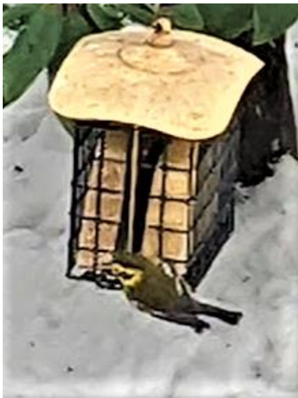
Townsend's Warbler at suet feeder, Glen Eagle, January 1, 2022.