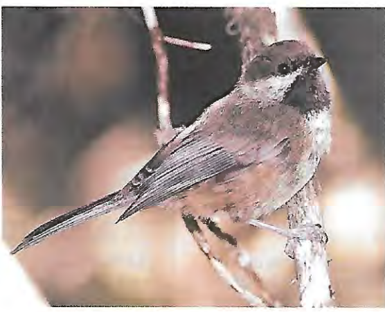
Boreal Chickadee

lives by herself with two big roosters, three dogs and 40+ horses, mostly Clydesdales. She goes out in -30 degree weather to feed the animals!