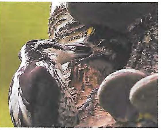
Three-toed Woodpeckers, by Matti Suopajärvi

We finally arrived at the lady's house. She was working outside, wearing a tank top (we were dressed in layers). She