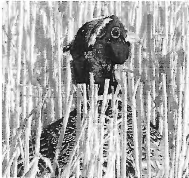
Ring-necked Pheasant, by Terry Gray

Adeline Gildow had another good month with a total species count of 29 from her Camano Island home. She spotted 6 Bald Eagles circling Juniper Beach, as well as 18 Canada Geese , 2 Killdeer , an Osprey , 7 Great Blue Herons and a number of Dunlin . She also reported 2 Fox Sparrows ,