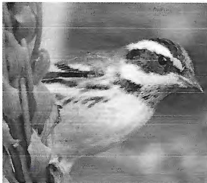
Black-throated Gray Warbler

A Wilson's Warbler made a brief appearance at Hilkka Egtvedt's home in Mukilteo. She also reported 12 American Goldfinches , 14 Band-tailed Pigeons , a Bullock's Oriole , 5 California Quail , 5 Chestnut-backed Chickadees , a Glaucous-winged Gull , 2 Olive-sided Flycatchers , 3 Pileated Woodpeckers , 2 Rufous Hummingbirds , 5 Spotted Towhees and 3 Hairy Woodpeckers for a total species count of 25.