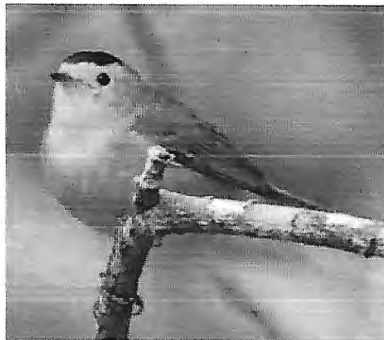
Wilson's Warbler