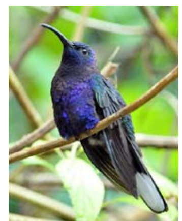
Violet Sabrewing

Since their move, several of us have traveled to Costa Rica to visit them. We've been treated – not only to great birding – but to seeing their lovely new homeland through their eyes. They know Costa Rican birds and great places to see them.