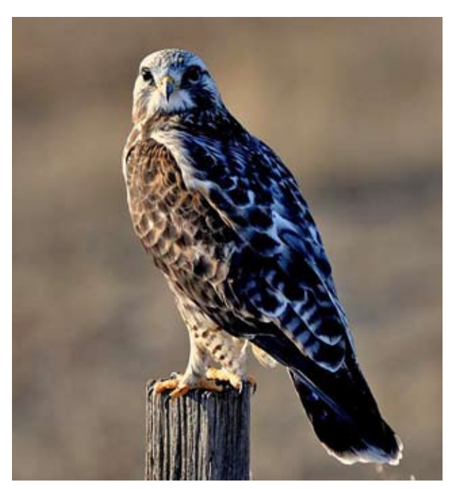
Rough-legged Hawk, by Donald Metzner