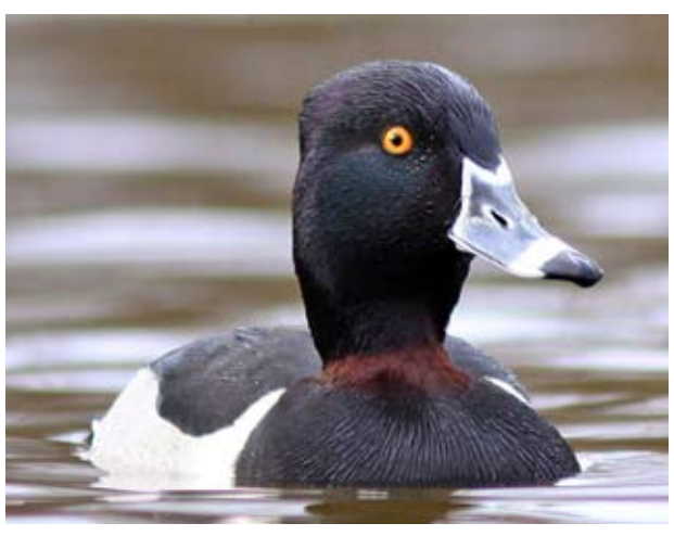
Ring-necked Duck, by Nigel

Highlights from Julie O'Donald in Brier included 2 Townsend's Warblers and a Yellow-rumped Warbler . She also listed 2 Anna's Hummingbirds , a Bewick's Wren , 30 Bushtits , 4 Northern Flickers , a Killdeer , 3 Red-breasted Nuthatches , a Ruby-crowned