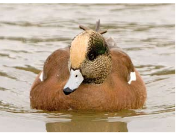
American Wigeon, by Annette Colombini

Kinglet , 2 Varied Thrush and a Western Screech Owl for a species count of 22.