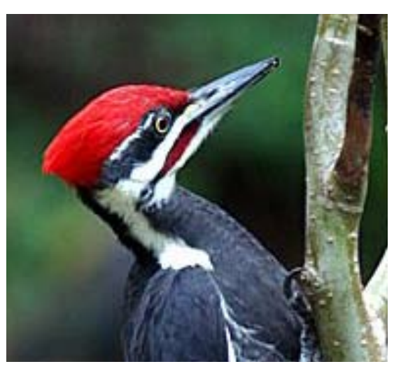
Pileated Woodpecker

Apparently the Western Screech Owl has made a home in a tree nearby as she saw it again in early November. Her report also included 2 Anna's Hummingbirds, 12 American Robins eating Mountain Ash berries, 12 Bushtits, 3 Northern Flickers, a Townsend's Warbler, 2 Varied Thrush, a Bewick's Wren and a Yellow-rumped Warbler for a total species count of 20.