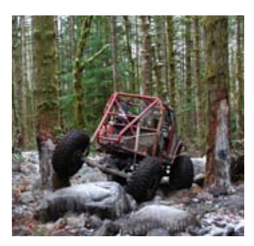
A "tube buggy" moves through trees scarred by previous ORV use.

DNR issued a Determination of Nonsignificance (DNS) under