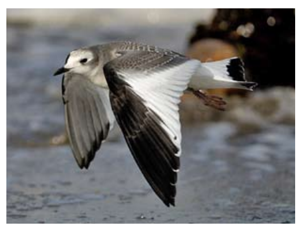
Sabine's Gull