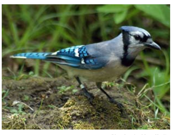
Blue Jay, by Marg Heslin

Woodpeckers, 3 Great Blue Herons, 3 Barn Owls, 27 Trumpeter Swans, 4 White-crowned Sparrows, 2 Ruby-crowned Kinglets, 3 Varied Thrushes, a Red-breasted Sapsucker and 1000s of Dunlin at Juniper Beach.