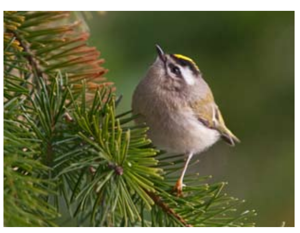
Golden-crowned Kinglet, by Annette Colombini