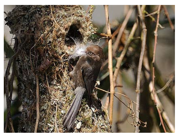
Bushtit, by Jim Martin

8 Golden-crowned Kinglets, 4 Western Gulls, 38 European Starlings, an Anna's Hummingbird, 7 American Goldfinches, a Lincoln's Sparrow, 3 American Robin, a Bushtit and 2 Mallards for a total species count of 21.