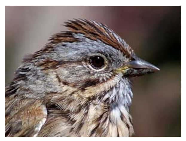
Lincoln Sparrow