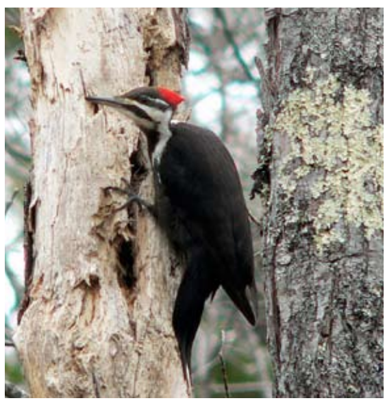
A Pileated Woodpecker takes advantage of all a dead snag has to offer.

I can think of no better example of my thesis than the 1,500 people who attended the fourth annual Swifts Night Out in Monroe on September 10 – and stood and applauded as the last of 3,500 Vaux's Swifts swirled into the chimney to roost as darkness fell the second Saturday in September.