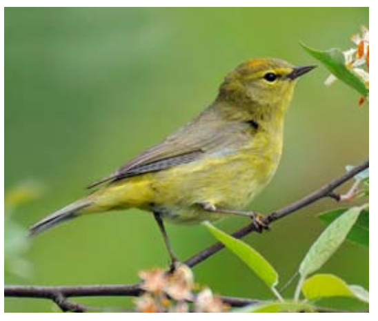
Orange-crowned Warbler

3 Northern Flickers, 6 Bushtits, an Anna's Hummingbird and 4 American Robins.