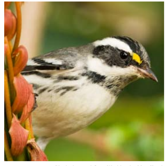
Black-throated Gray Warbler, by Matt Knoth

Kriss Erickson's total species count of 8 from Everett included 3 Steller's Jays, 6 Black-capped Chickadees, a Bewick's Wren,