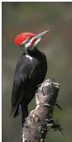
Pileated Woodpecker Rex Guichard