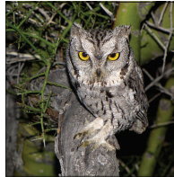
Western Screech Owl

Comments and suggestions are always welcome. E-mail me at backyard@pilchuckaudubon.org or leave a message on my cell at 425-750-8125. If you are interested in participating in our monthly birds counts, please contact me.