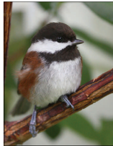
Chestnut-backed Chickadee Rex Guichard

It was a beautiful morning to be on the water: not too hot or too cold, and sunny enough for good light but not enough to burn those of us with fair skin. The first birds to greet us were the 100 or so Heerman's Gulls hanging out on the jetty that protects the marina. We could clearly see their red bills and feet, and besides, Susie Schaefer had told us they were Heermann's Gulls before we left port. As we traveled north through Puget Sound, the next birds we encountered were Marbled Murrelets in various stages of molting from breeding plumage to winter plumage. As I'm sure many readers will already know, the murrelets belong to a family of birds known as alcids. This group was well represented on the boat tour, with species including Rhinoceros Auklet , and the Pigeon Guillemot already mentioned. By way of adding more members of the gull family to our checklist, our captain motored out into the channel and let us get a close look at a group of gulls we had seen feeding together. The group included the familiar Glaucous-winged Gulls , but also the much-smaller Bonaparte's Gulls in their winter plumage with just a single black dot behind their eyes to tip us off that they were Bonaparte's and not Mew Gulls. Swinging back close to shore as we started to head south, we saw a lone Red-necked Grebe , at least when he was above the surface of the water.