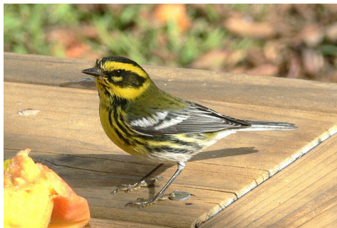
Townsend's Warbler