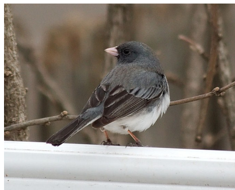
Dark-Eyed Junco by Dori

Fifty+ Pine Siskin descended on Julie O'Donald's yard in Brier along with 12 American Crows, 2 Bald Eagles, a Barred Owl, 8 Bushtits, 2 Bewick's Wren, 2 Golden-Crowned Kinglets, 7 Band-Tailed Pigeons, a Pileated Woodpecker, 2 Northern Flickers, a Townsend's Warbler, 2 Red-Breasted Nuthatch and a Varied Thrush for a total species count of 23.