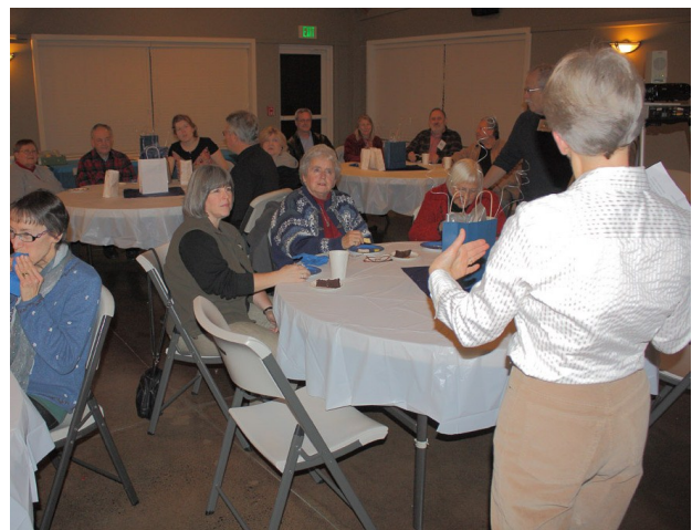
On Friday, December 14 th , a group of Pilchuck committee chairs and major donors enjoyed an evening of refreshments and a viewing of the film "The Central Park Effect" about the birds and birders of New York's Central Park.