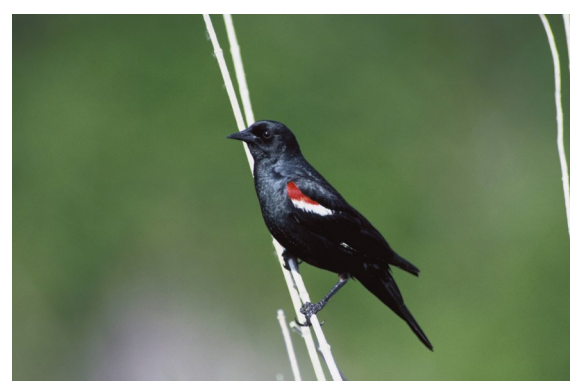
Tricolored Blackbird (Photo by Dave Menke)

Source: Sahagun, Louis. "Central California farmers save 65,000 rare, tricolored blackbirds." Los Angeles Times 14 June 2013. Web. 27 October 2013.