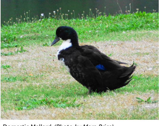
Domestic Mallard

If you have any suggestions or questions, please contact me at pricemara@clearwire.net or call my cell at 425.750.8125.