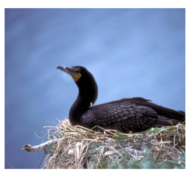
Double-crested Cormorants

Taking advantage of the beautifully sunny weather on August 23, seven birders ventured to a popular summer destination: Jetty Island. The island is a narrow strip of land running north-south for two miles just offshore from Everett's waterfront. In the summer months, there is a free ferry that makes the two-minute journey out to the island and back.