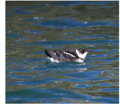
Marbled Murrelet floats on the water

patches as he flew by, and two species we had been hoping for: Rhinoceros Auklets and Marbled Murrelets. We got close views of both these species, and the highlight of the trip was getting to view one of the auklets forage fish near the surface. He was an incredibly agile swimmer and kept this small school of fish swimming in many directions trying to evade him.