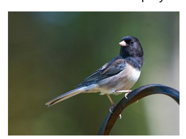
Dark-eyed junco

Launched in 1998 by the Cornell Lab of Ornithology and National Audubon Society, the Great Backyard Bird Count was the first online citizen-science project to collect data on wild birds and to display results in near real-time. Since