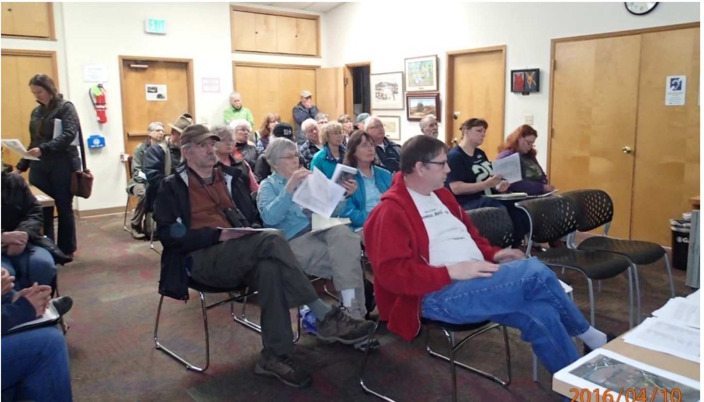
Leque Island survey volunteers at orientation.