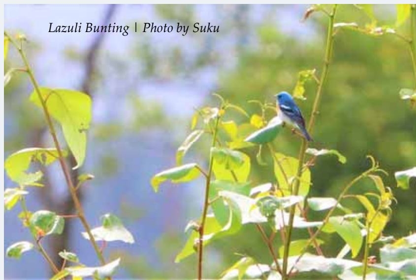
Lazuli Bunting

We finished our birding around 1:00 p.m., after which we reconvened at Buzz Inn Steakhouse for lunch. 🦋