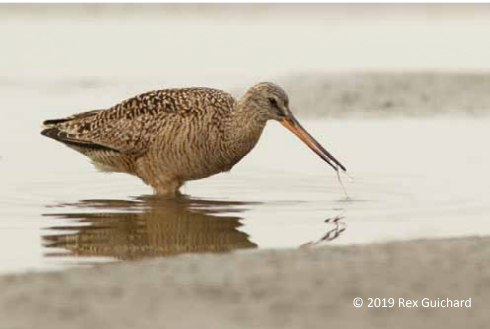
2019 Birdathon Washington Big Month Winning Entry