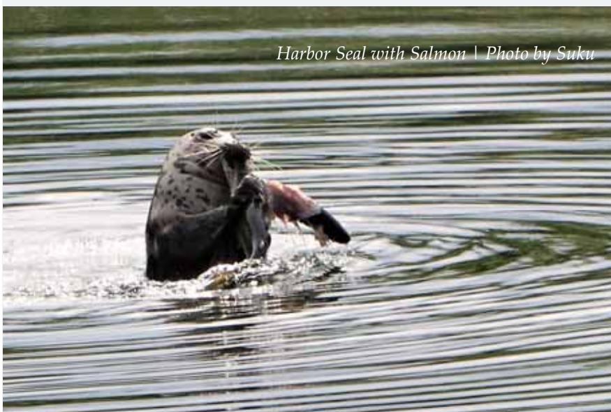
Harbor Seal with Salmon | Photo by Suku

sky, finches and sparrows in the shrubs beside the trail and along the dike, both Anna's and Rufous Hummingbird among the flowers, and Mourning Dove and Willow Flycatcher in the trees. A special treat was a group of Lazuli Bunting at the edge of the field west of the trail. In addition, we observed a harbor seal with a salmon in its mouth in the river near the eastern part of the dike.