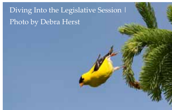
Diving Into the Legislative Session

We need legislators to continue to prioritize climate and clean energy. If you haven't already, e-mail your legislators now to ask him/her to continue to lead on climate .