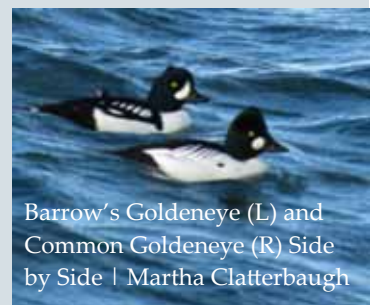
Barrow's Goldeneye (L) and Common Goldeneye (R) Side by Side

We then crossed the walkway over the railroad tracks and proceeded to the scrubby area that runs northward beside the sea. When we reached the beach, we found several ducks in the nearby water, which we watched and discussed for some time while they obligingly drifted closer to shore. At close range, we were sure that we were seeing both Barrow's and Common Goldeneye. We also found several Horned Grebe and one Double-crested Cormorant.