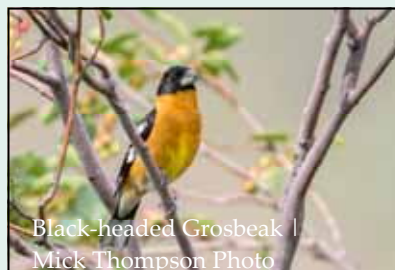
Black-headed Grosbeak

If you are interested in participating in the Backyard Birding count, please email me at pricemara1@gmail.com or leave a message on my cell phone at 425-750-8125. 🐦