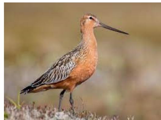
Bar-tailed Godwit

https://earthsky.org/earth/longest-nonstop-bird-flight-world-record-bar-tailed-godwit-2022/ .