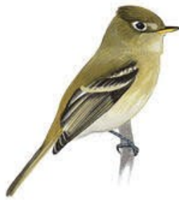
Pacific-slope Flycatcher

Maureen Schmitz's report from Everett included 2 Red-breasted Nuthatch, 4 House Finch, 2 American Crow, 20-30 European Starling, 4 Band-tailed Pigeon, 2 Steller's Jay, 2 Northern Flicker, 4 Black-capped Chickadee, 2 Song Sparrow, 2 American Goldfinch, 2 Black-headed Grosbeak, 4 Dark-eyed Junco, 2 Spotted Towhee, a Bewick's Wren, a White-crowned Sparrow, 5 Caspian Tern, 2 Anna's Hummingbird, 20 Bushtit, a Hawk species flying over, 50+ Canada Goose flying over, and 2 Downy Woodpecker, for a total species count of 21.