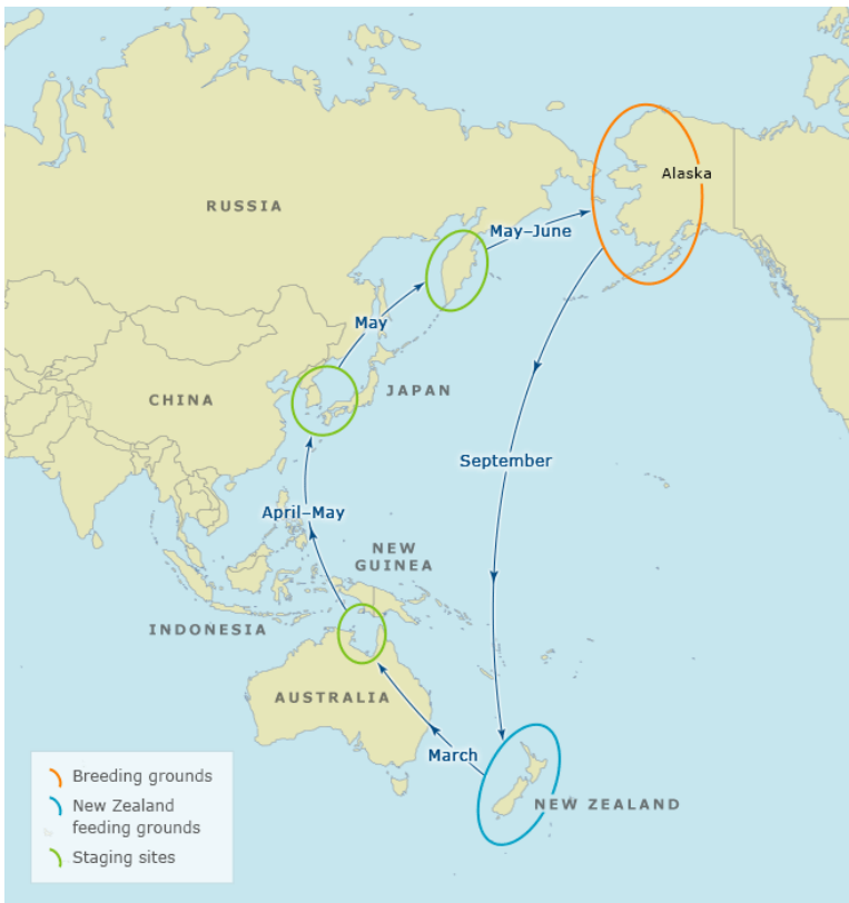
Bar-tailed Godwit migration route | teara.govt.nz