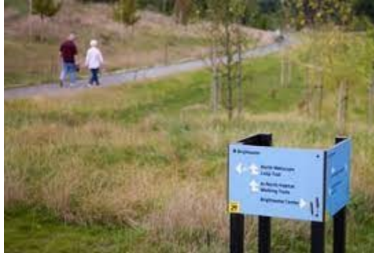
Brightwater Center Trail | kingcounty.gov

After briefly inspecting the dahlias and some outdoor exhibits next to the Art building of the Brightwater Center, several more of us said good-bye, while the remainder headed off to lunch at the Crystal Creek Cafe. We had birded for almost 4 hours, walked about 3 miles, and reported 25 species of birds. 🦅